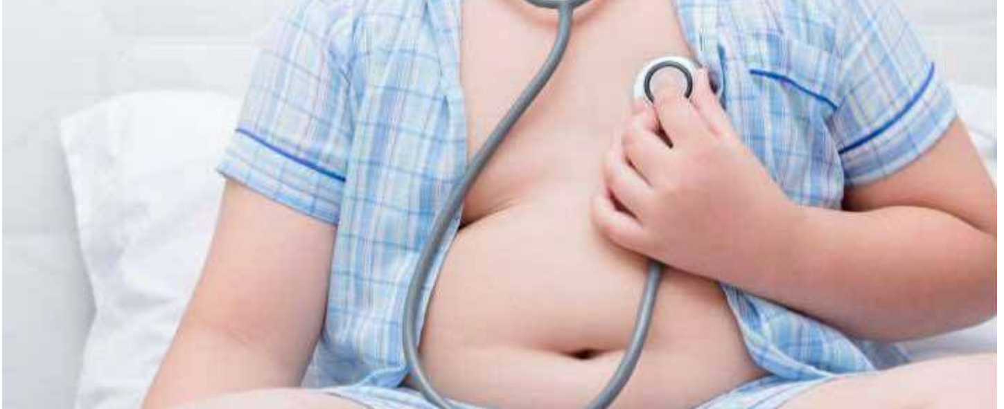
Resistance training can overcome childhood obesity

A new review has found that strength-based exercises, such as squats, lunges, and push-ups, could be an effective way to reduce obesity in children.