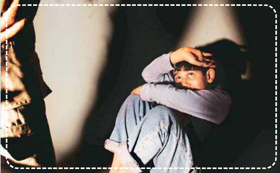
Some parents think since the child is their 'property' they can do what they like with them