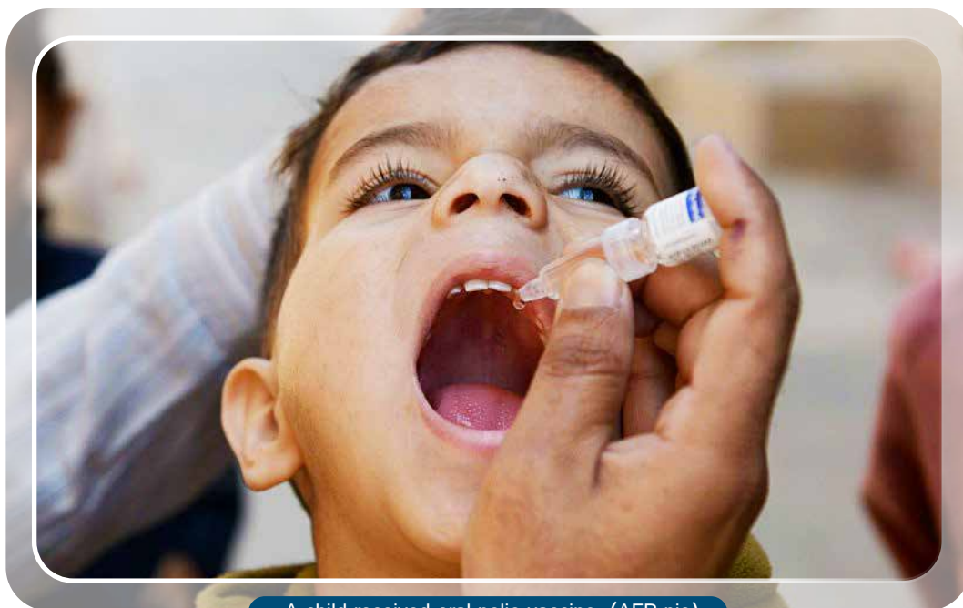
A child received oral polio vaccine.

“The ongoing situation continues to require that a public health emergency of international concern should be applied.”