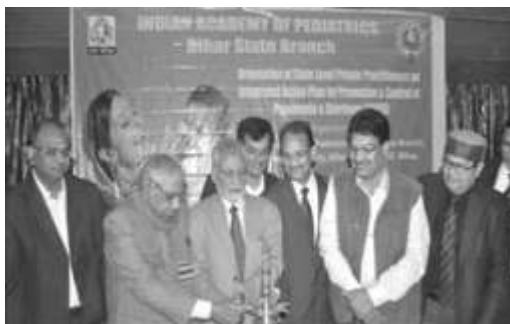
State Level Orientation of Private Practitioner - IAPPD

Indian Academy of Pediatrics - Bihar State Branch