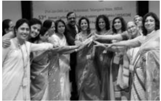
Together - Zone of Empowerment

“Women add creativity, strength and color – Within her is the power to create, nurture and transform. Nobody gives you power. You just take it” .