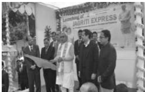
Launching of Jagriti Express - Community Awareness Vehicle