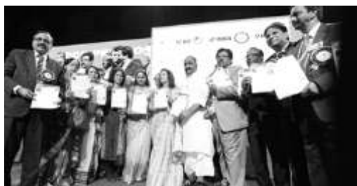
Release of the Brochure of IAP Women's Wing