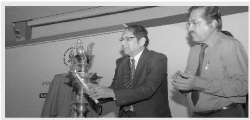
Inauguration of ACE 10/ 10 (Pediatricians as Adolescent Health Ambassadors) Program in Delhi