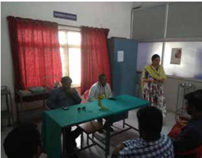
Breast Feeding Awareness Speech to Antenatal and Postnatal Mothers