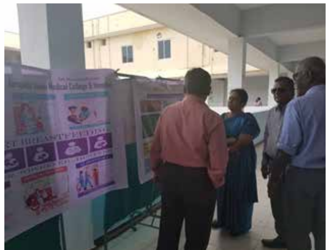
Breast Feeding Awareness Posters Competition