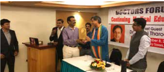
Dr Sasi tharoor MP felicitating IAP president Kerala