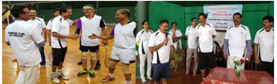
All Kerala IAP Inter District Badminton Championship was held on 14th January @ Thrissur