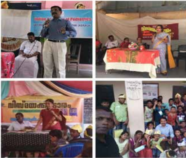
Active participation in BRC (Block Resource Centre) camps for evaluation of learning disability as the Presidential Action Plan 2018