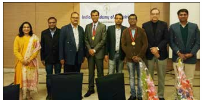
The installation ceremony of new executive of IAP Udaipur and CME