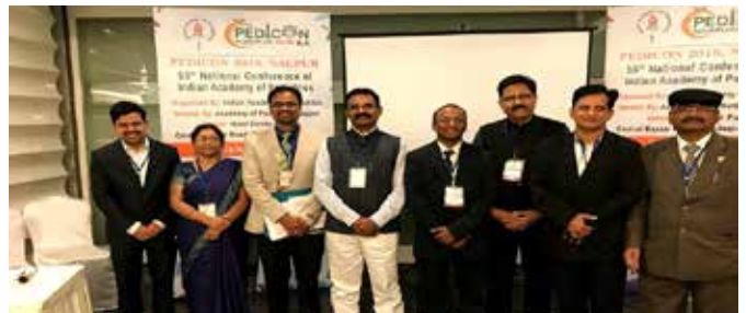
Pedicon Epilepsy workshop faculty