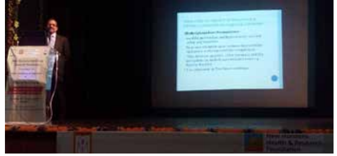
2nd Annual New Horizons Conference on Developmental Neurosciences