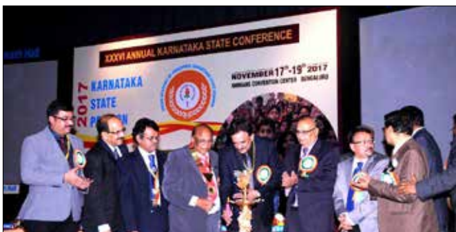
Inauguration of Karnataka State pedicon at Banaglore on 17th Nov 2017