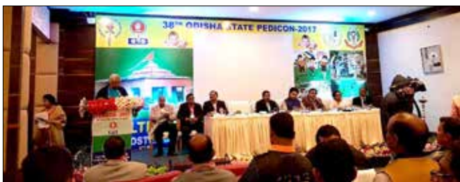
Odisha State Pedicon held at Jajpur Road, Odisha on 25th Nov 2017