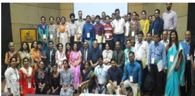
Trainers Workshop on IAP National Consensus Guidelines on NDP at New Delhi September 2017