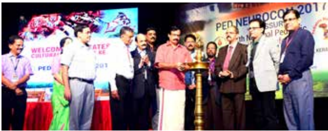
Inauguration of IAP Neurology Chapter National Conference at Thrissur, Kerala on November 13, 14 and 15. Inaugurated by Prof. C.Raveendranath, Hon. Education Minister, Govt. of Kerala