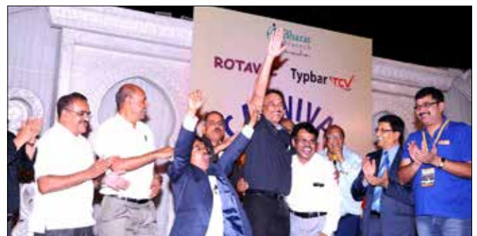
Moments after the election result with victories of EB members from Karnataka