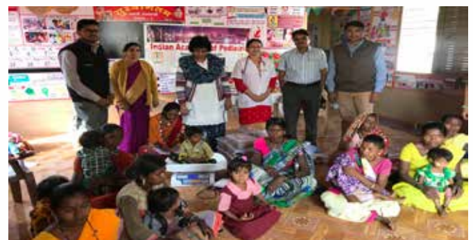
IAP Nashik initiated to take care and help all malnourished children from Trimbakeshwar, Peth and Harsul talukas.