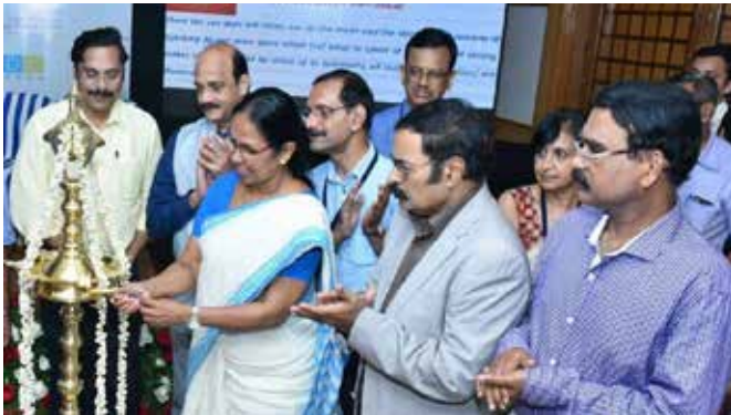
PEDINEUROCON Conference at Thrissur