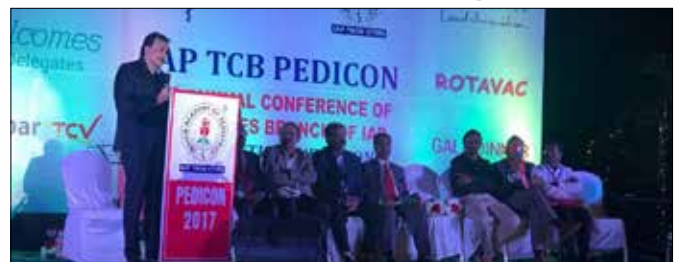
TCB PEDICON - Twin City Branch Pedicon held at Hyderabad 25th & 26th November, 2017