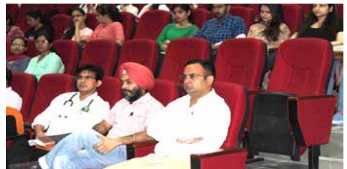
Adolescent Health Care Week Celebration