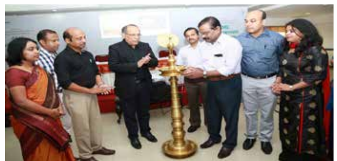
CME on Current Trends in Autism Interventions at Aster Medcity in collaboration with IAP Chapter of NDP in October 2017.