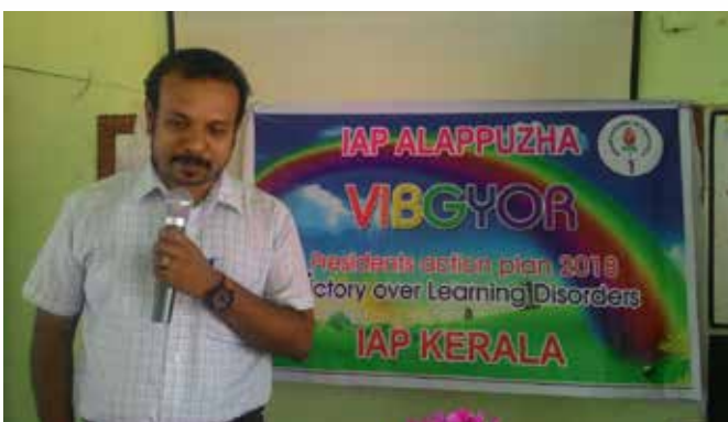
PRESIDENT'S ACTION PLAN