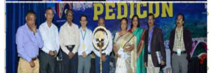
11th Howrah Pedicon, Annual CME on 3rd December 2017 at Fortune Park,Panchwati