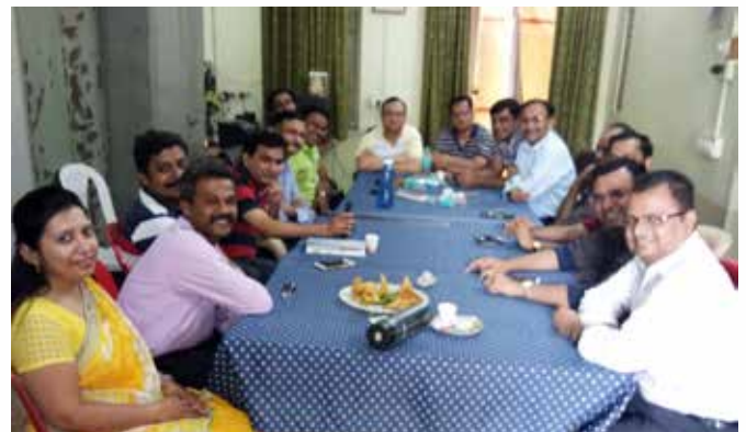
9-6-18 - GBM for Mahapedicon 2019