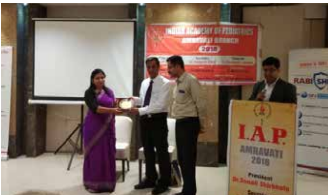
CME on Rabies