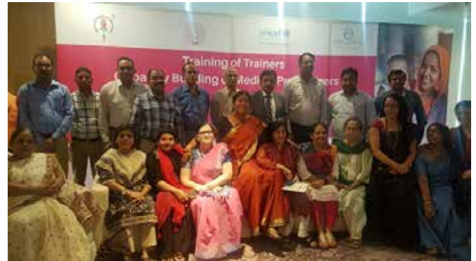
TOT Workshop on Maternal infant and child nutrition at Patna with IAP FOGSI and UNICEF and representatives of ALIVE AND THRIVE AN NGO funded by Bill and Gates foundation