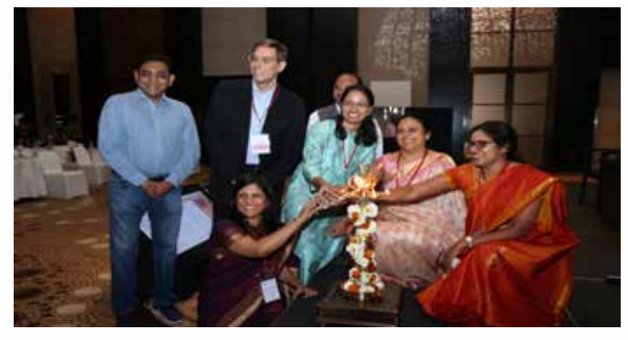
Inauguration ISPAD premeeting Symposium