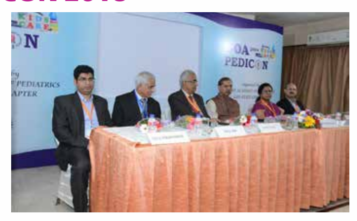
GOA PEDICON 2018, on 24th &25th February at Hotel Mandovi Panjim. A workshop on CPAP & HHH-FNC on 24th. The scientific sessions with renowned faculty was held on 24th and 25th . Also had a poster presentation for the postgraduate students.