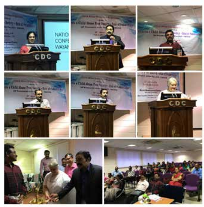
NSSK training programe for nurses (NRP). Around 40 nurses participated.