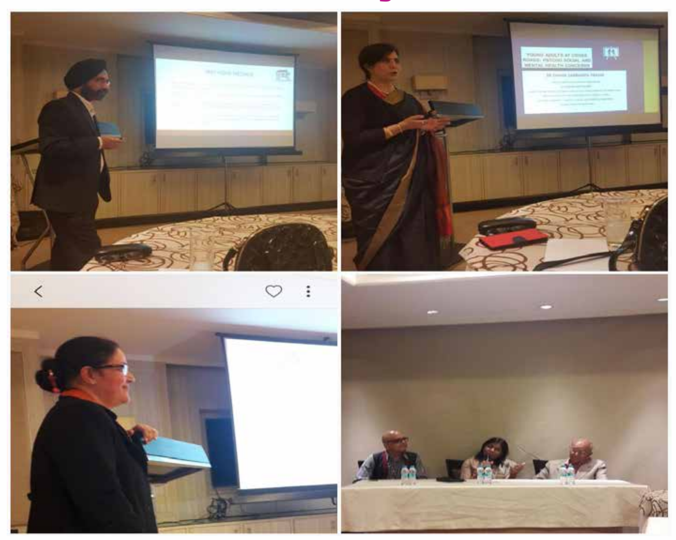
Seminar on "Approach to Adolescent Health Concerns in Office Practice" conducted by Centre for Autism and Intellectual Developmental Disorders ASHA in collaboration with IAP Chandigarh on 24th Feb 2018.