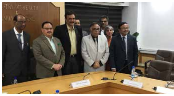
PEDICON 2019 Meeting