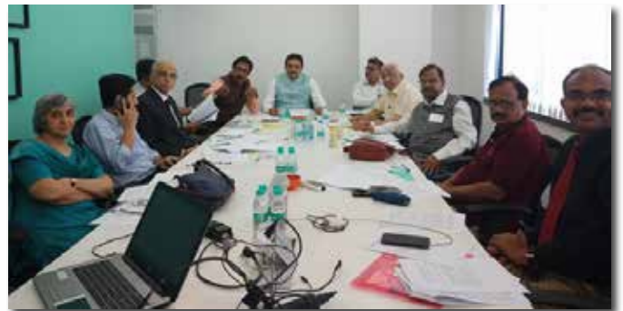
OB meeting - Oct 14 2018