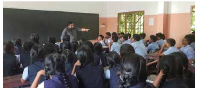
Aster Medcity Adolescent Week Celebrations at Kothad School, Ernakulam