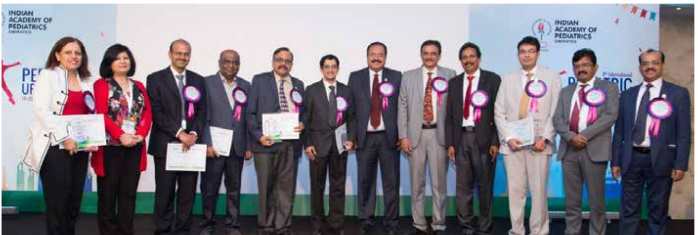
8th International Pediatric Update, Dubai - Oct 19-20, 2018