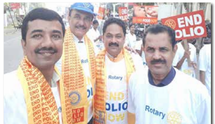
Polio rally in Mangalore on 24th Oct 2018