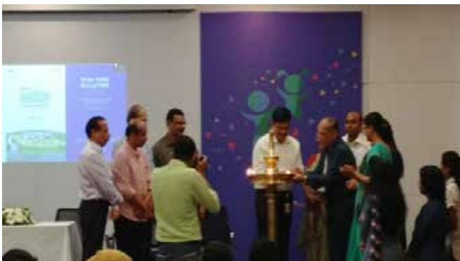
CME on Neurodevelopmental Disorders at Aster Medcity, Kochi.