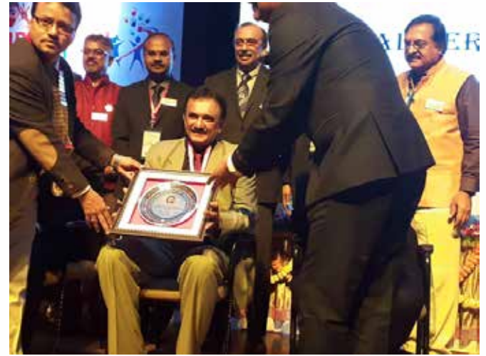
Karnataka Pedicon, Dharwad - Oct 12-13, 2018