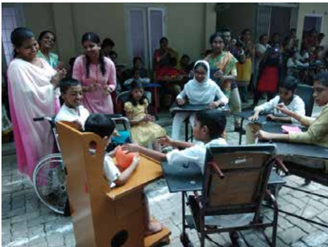
At NIPMR Irinjalakuda, Kerala, our CP and ASD kids had fun too on Children's day. Race, passing the ball, quiz programme etc. How they love getting prizes!