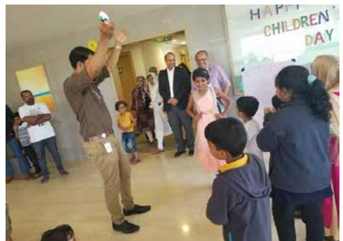
Diabetes Day celebrations Aster Medcity