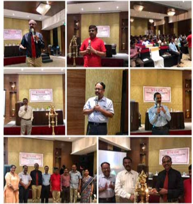
CIAP – STRIDE Master class on Fever, Cough and Sneezing was conducted on 27.10.18 at Hotel Hycinth.