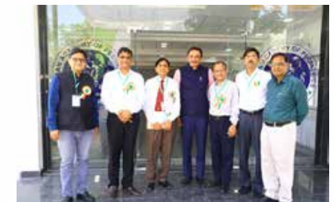
Raj Pedicon Kota - Oct 20-21, 2018