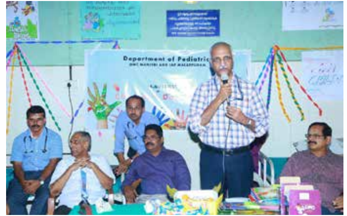
Children's Day Celebrations IAP Malapuram