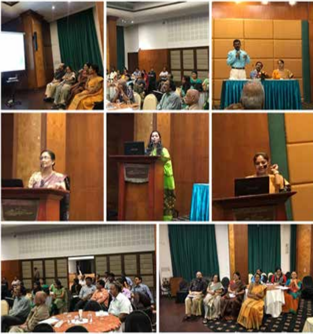
Rational antibiotic day CME by Thiruvananthapuram IAP - Panel discussion on rational antibiotic therapy in pediatric practice - 28.9.18