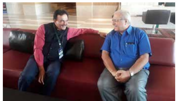
Confrence of PATS - Hyderabad - 7th oct 2018