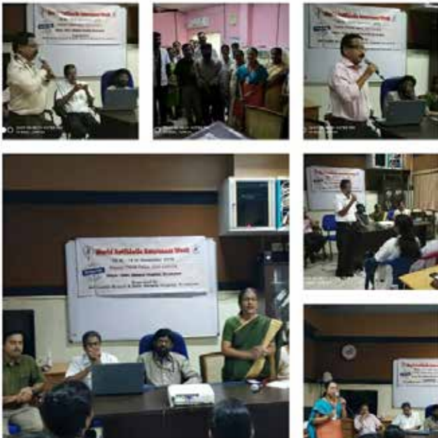
Antibiotics awareness week, At GH Ernakulam