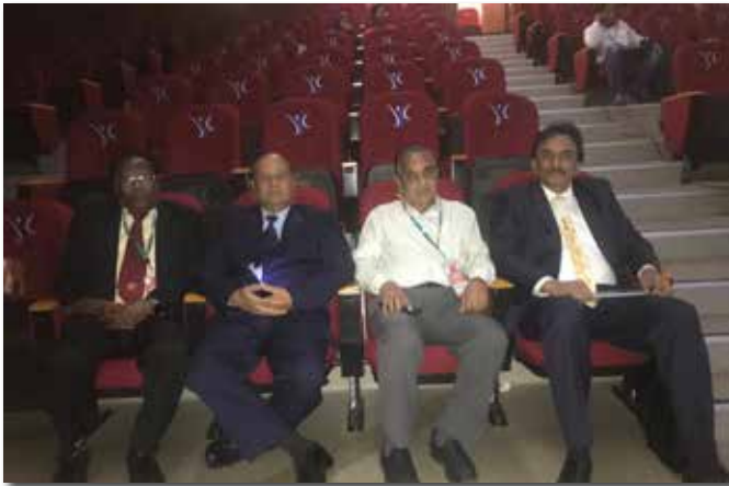
IAP TCB - Secunderbad - 6th Oct 2018