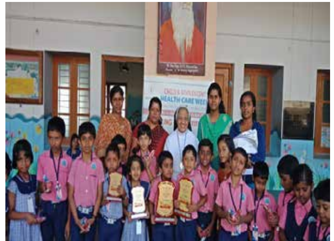
Children's Day Celebrations - IAP Malapuram