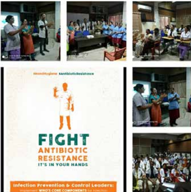
Antibiotic Awareness Week GH Ernakulam