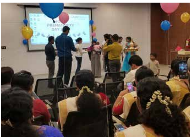
Premature Day Celebrations Aster Medcity, Kochi