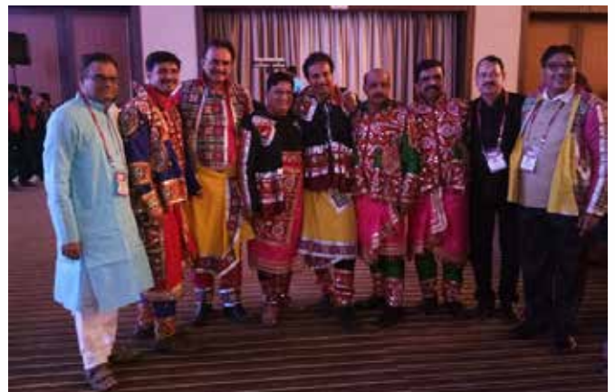
21st NCPID 2018 - Ahmadabad - 26th October 2018