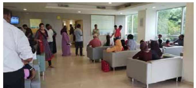
Adol week celebrations at Aster Talk of Girl Child at the OPD