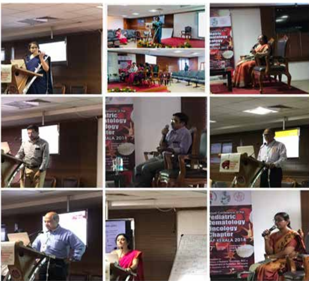
IAP Thiruvananthapuram in association with RCC Trivandrum conducted the State Onco-hematology Conference at RCC Trivandrum on 7.10.18.