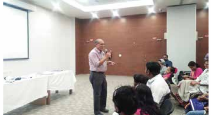
Diabetes Day celebrations Aster Medcity, Kochi