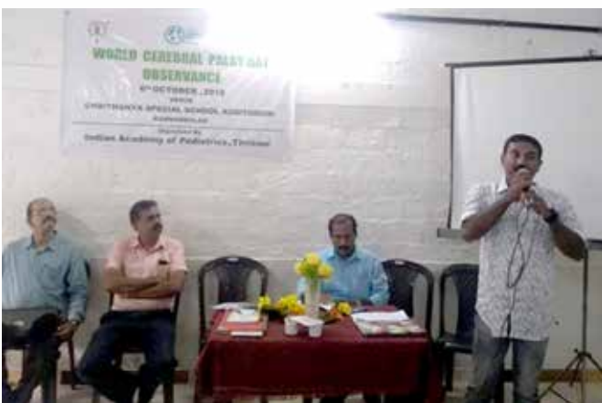
World cerebral palsy day at Chaithnya School, Kunnumkulam, Kerala