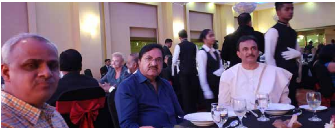
SRI LANKA Conference SEP 2018