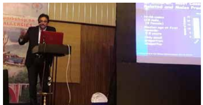
1st CME cum workshop on Childhood allergies 30th SEP 2018