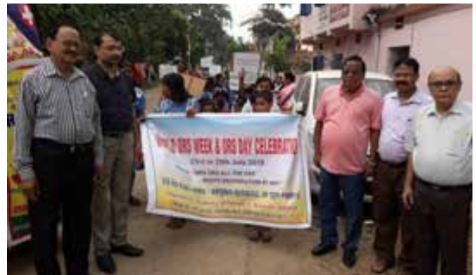
ORS Week celebration