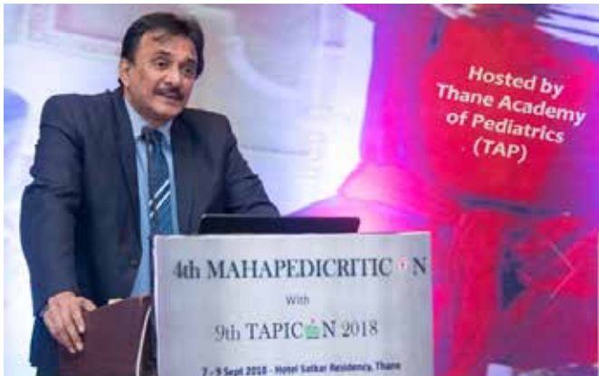
4th Mahapedicriticon SEP 2018