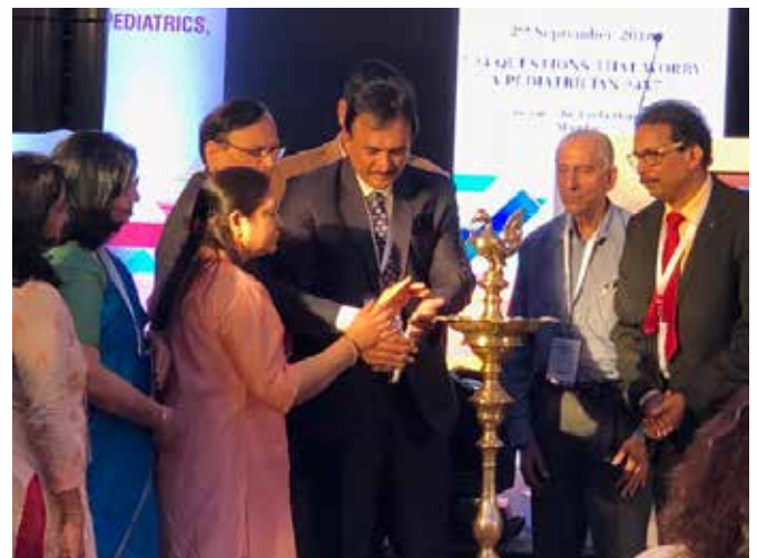
EMBICON 2nd SEP 2018