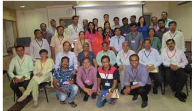
Antibiotic Stewardship CME for General Practitioners' organised on 02nd September 2018, 08th September 2018 and 11th September 2018