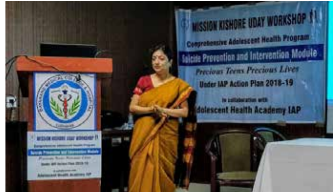
Mission Kishore Uday 2018