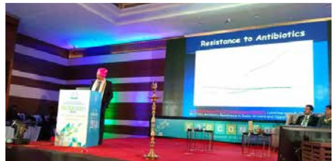
KAPCON conference SEP 2018