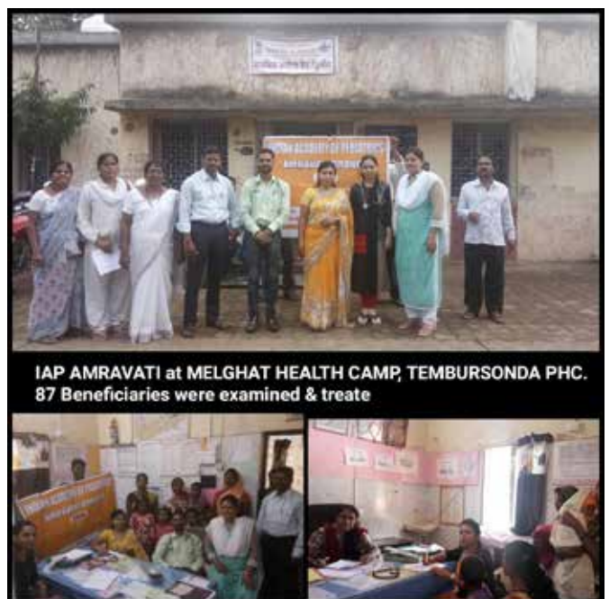
Melghat Health Camp