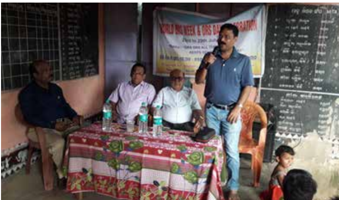
Breast feeding Week celebration