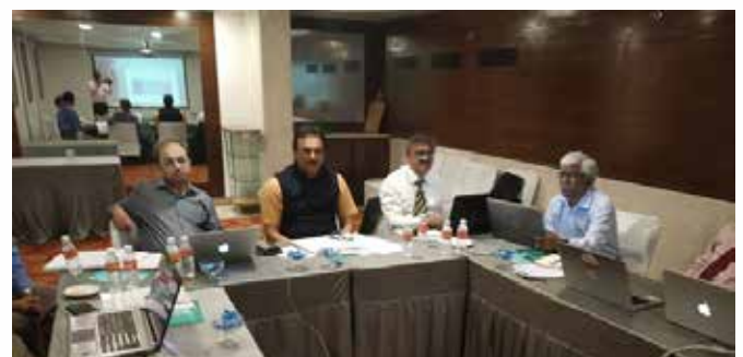
ACVIP meeting SEP 2018