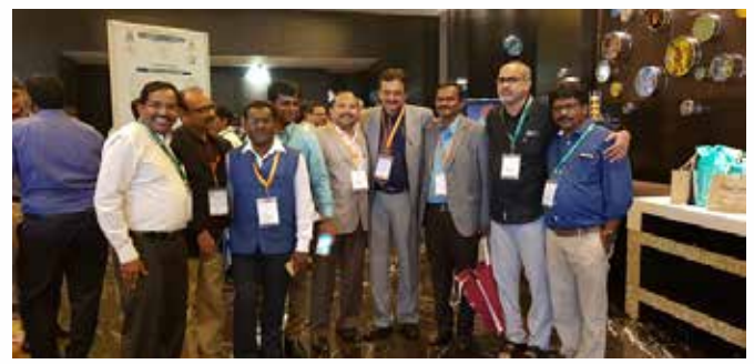
4th PATSCON and 15th NCDP SEP 2018