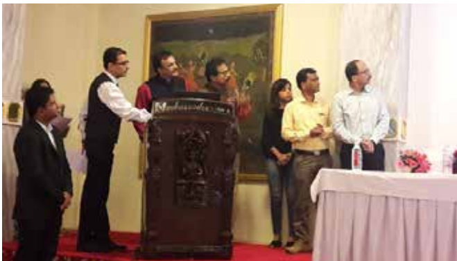
Launch of Yuva IAP and Yuva IAP website