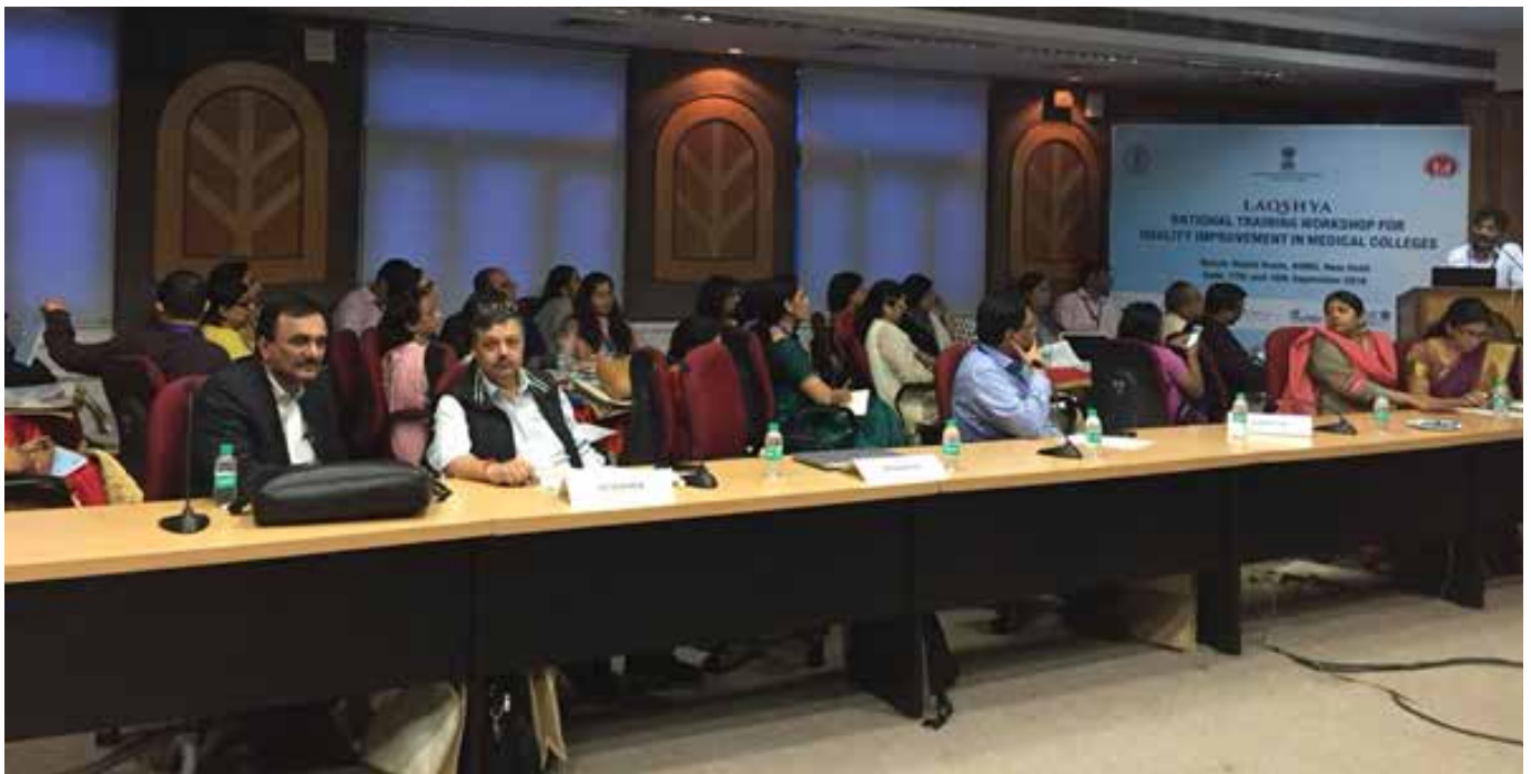
Quality Initiative at AIIMS