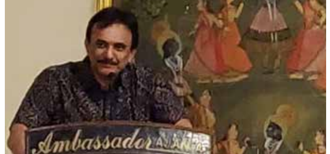
IAP Yuva Forum meeting Aurangabad 15 SEP 2018