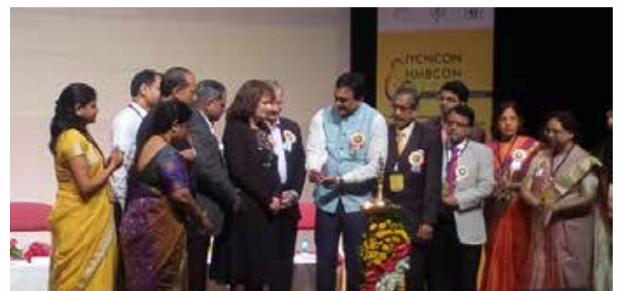
IYCNCON and HMBCON SEP 2018