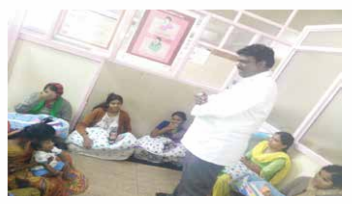
Interactive Session with Nursing Mothers in NICU, VVH