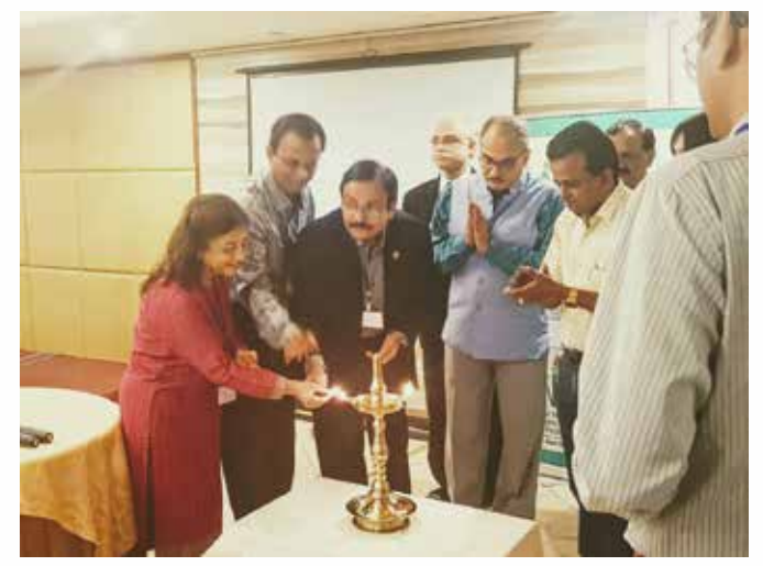
Inauguration of United Airway module, Navi Mumbai