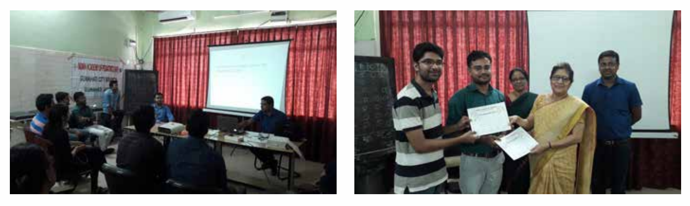
IAP Guwahati city branch organised IAP PG and UG Quiz College round in Guwahati on 13th July 2018 at Gauhati Medical College & Hospital, Guwahati, Assam.