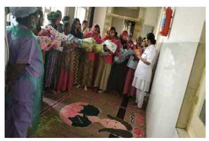
Explaining the Theme of WBF Week through Rangoli to Nursing Mothers of VVH