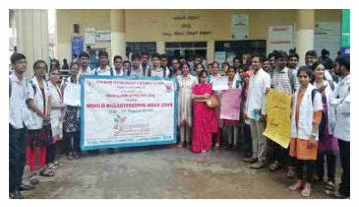
Rally by Under Graduates Inside Hospital Premises