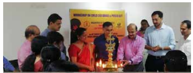
March 10 - Workshop on CHILD SEX ABUSE - ROLE OF MEDICAL PRACTITIONERS & OTHER STAKE HOLDERS - Venue: Believers Church Medical College Hospital, Tiruvalla