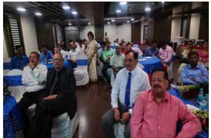
CME on 17th March 2019 at Hotel Panache Patna

The link to the Academy Today Mar 2019 issue