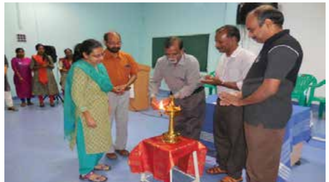
March 3rd : A BLS Provider Program was conducted at GMC Thrissur