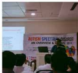
24th March Sunday World Autism day - The Department of Pediatrics, Believers Church Medical College and IAP Pathanamthitta conducted a CME on Autism Spectrum Disorder.