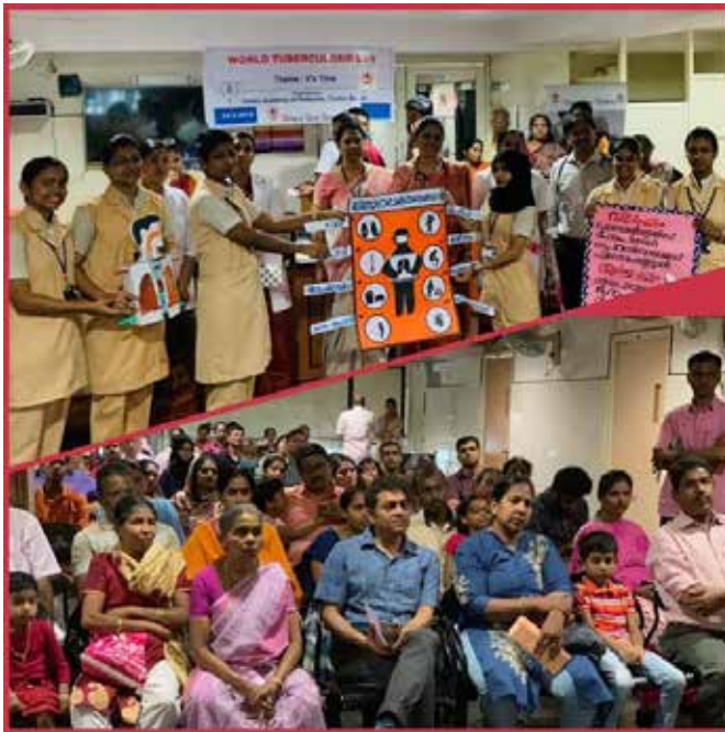
World Tuberculosis Day - awareness program conducted at Medical trust Hospital on 23.3.2019