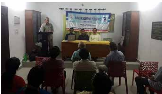
World Kidney Day