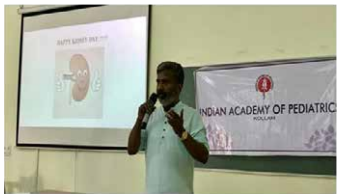
World Kidney Day