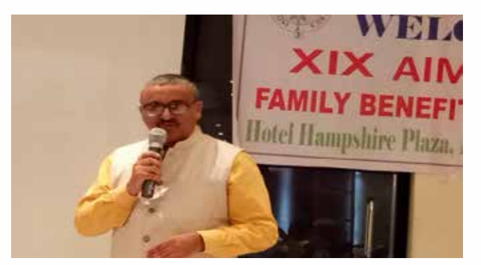
FBS AMCM, Hyderabad