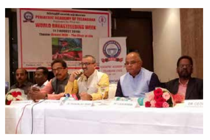
Press conference on Breast Feeding Week