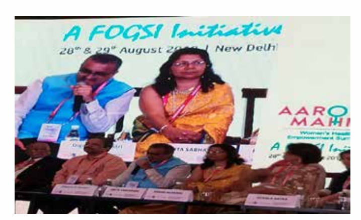
Expert panelist in FOGSi Conference on Women's health