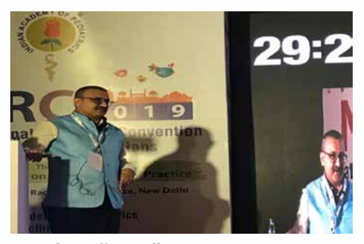
National Convention on Research in Office, Delhi