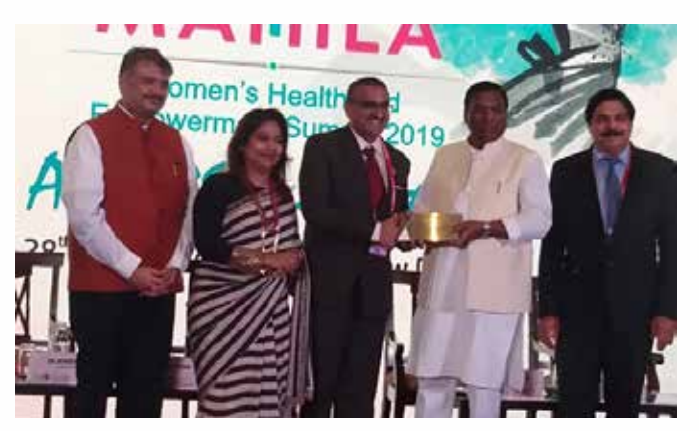
FOGSi appreciation award