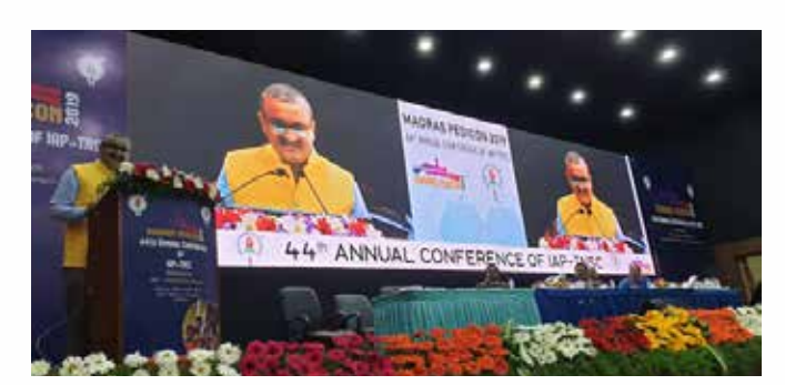
Madras PEDICON Chennai