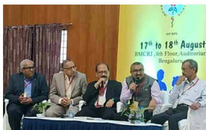
Adolescent Con Bangalore