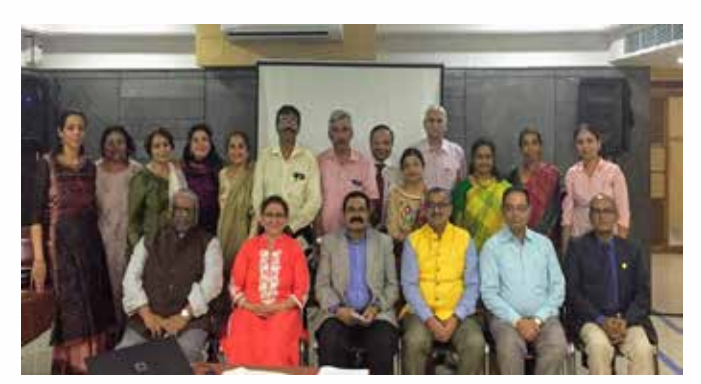
National Consultative Meet on Adolescent Friendly Health Services and Teen Suicide