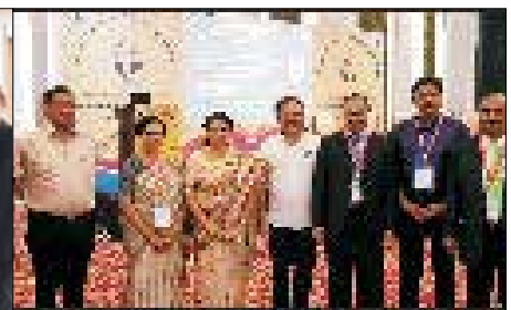
National CME on Pediatric Neurology