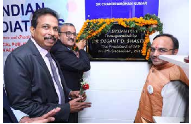
Inauguration of New IAP office, Noida