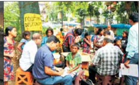
Health camps were organized for Street Children