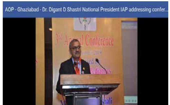
: Inaugurating annual conference of Trans Hindan branch of IAP, Gaziabad