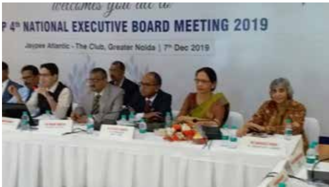
4th EB meeting, Noida