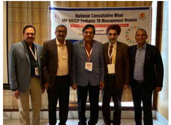
National consultative meet on IAP RNTCP Pediatric TB management module