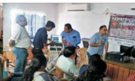
Pediatric Ventilation Workshop