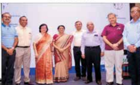
Antimicrobials Stewardship Module