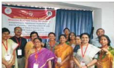
Mission Kishore Uday Workshop