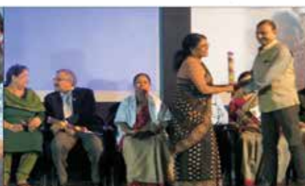
IAP CANCL Workshop