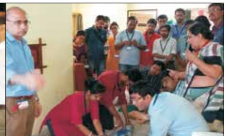
Basic Life Support Course