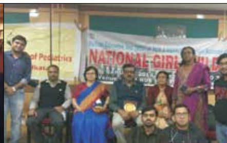
National Girl Child Day Celebration