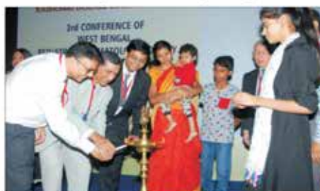
National conf of Kawasaki Dis Soc of India and State conf of WB ped rheuma society