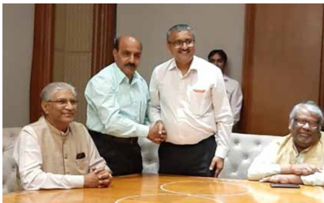
Welcome by President IAP TCB