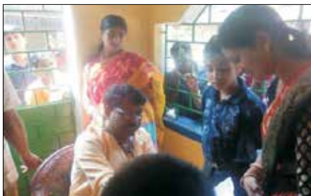
Health camps were organized in the remotest village