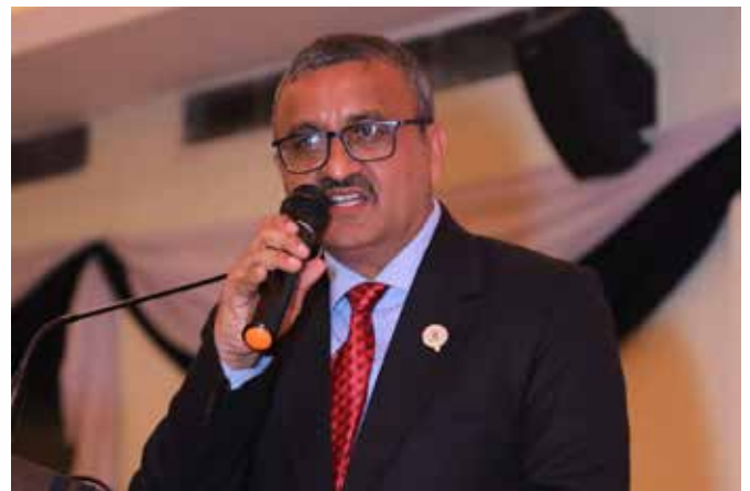
Felicitation function of Indian Pediatrics