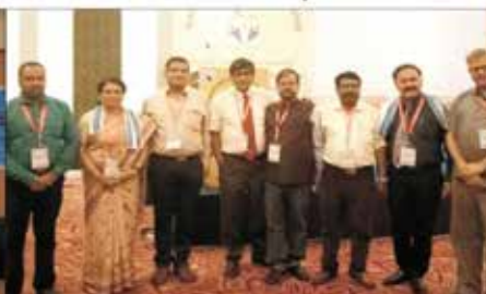
Pediatric Gastroenterology Update and ISPGHAN Midterm Conference