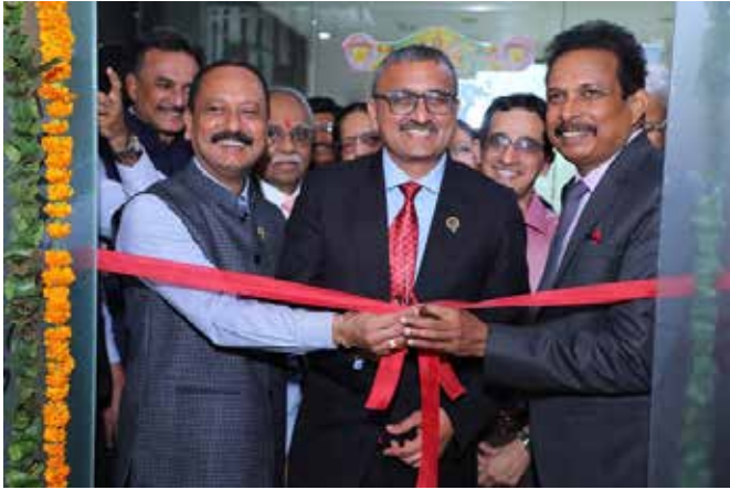
Inauguration of New IAP office, Noida