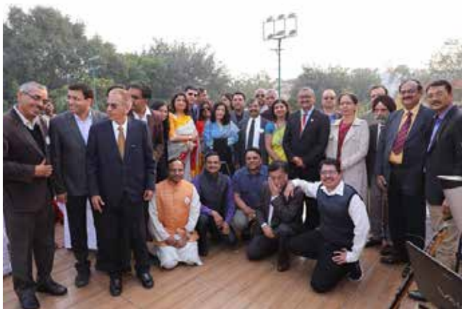
At annual day of IAP Noida