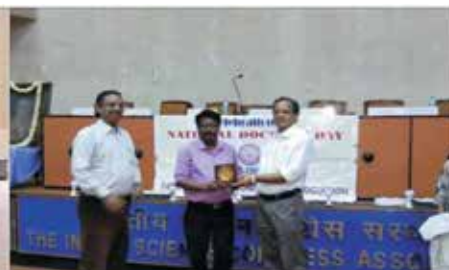
Doctors day Celebration