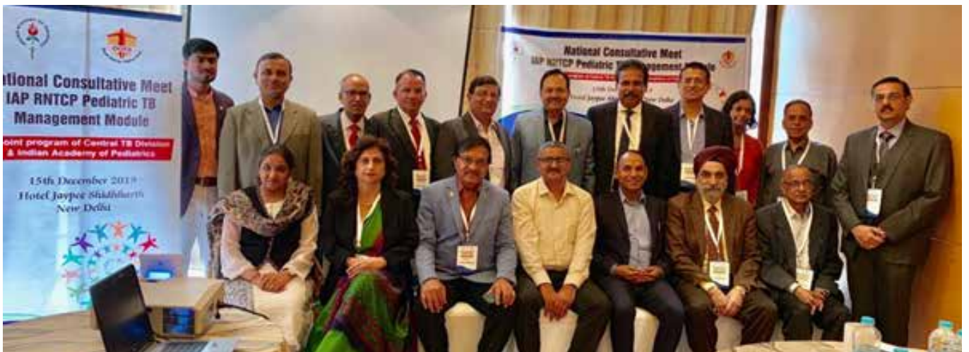
National consultative meet on IAP RNTCP Pediatric TB management module