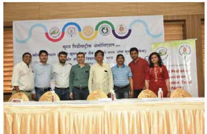
7780 ml human milk donated by 125 donor mother at 25th human milk donation camp at Surat