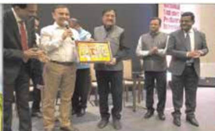
National Summer CME of IAP ID Chapter