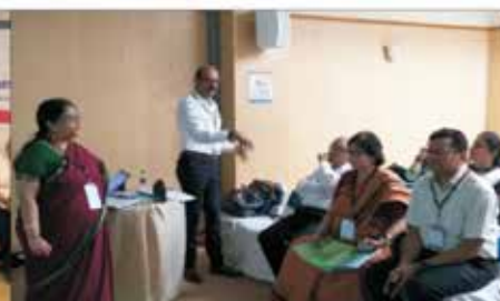
ALS MAP TOT