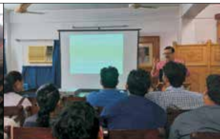
Monthly PG classes by eminent teachers in the WBAP Office