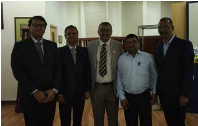
with IAP office staff