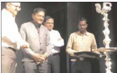
Mid Term CME Pediatric Pulmonology