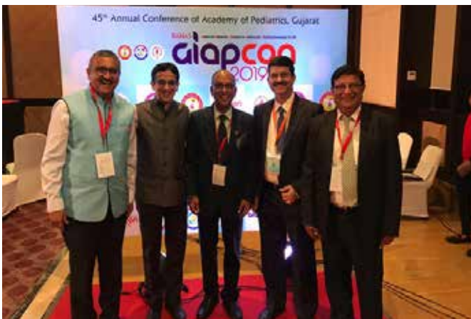
Gujarat PEDICON Udaipur