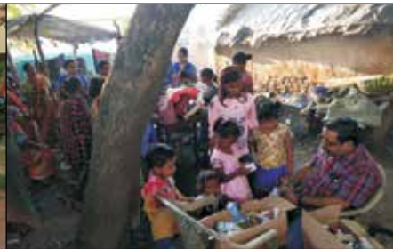
Visits to the flood affected areas