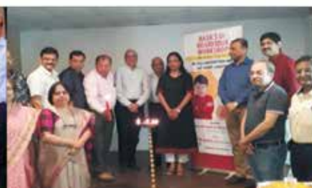
Basics of Behaviour module