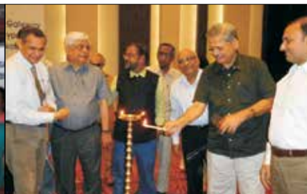
Mid Term CME of WBAP