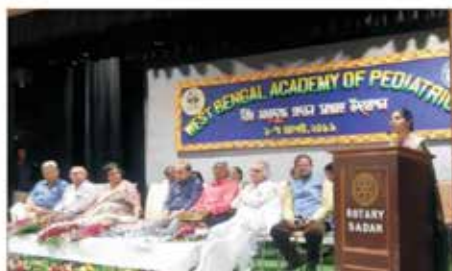
World Breastfeeding Week