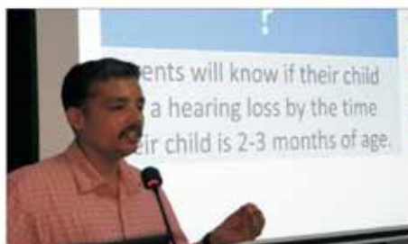
Hearing Screening Program