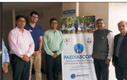
IAP Course of Basic Bronchoscopy