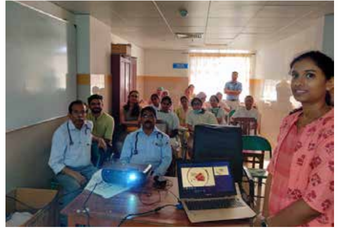
World Prematurity Day at Lisie Hospital, Kochi