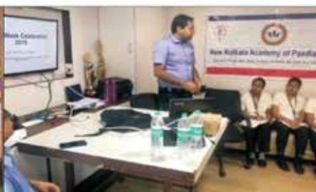
ORS Day Celebration