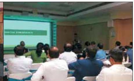
Monthly clinical meetings