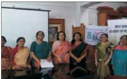
World Women Day Celebration