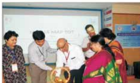
ALS MAP TOT