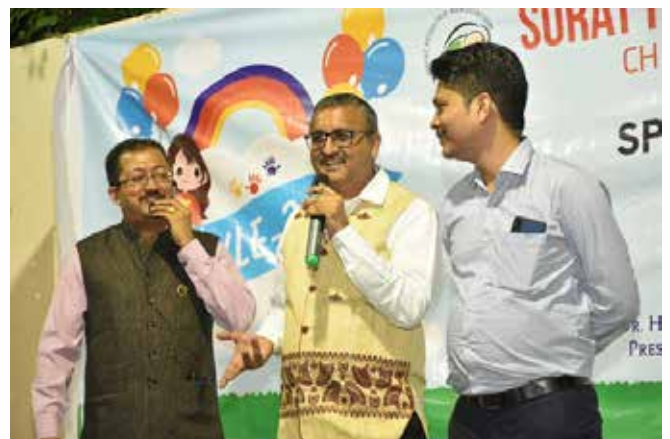
At annual day of SPACT receiving felicitation and addressing