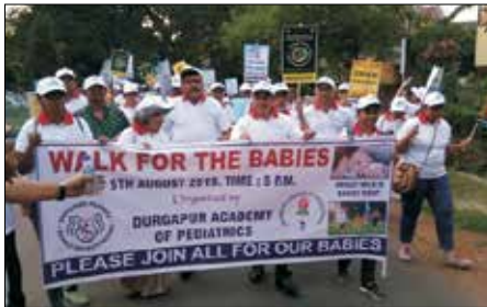
Health Checkup camps