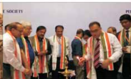
Pediatric Intensive Care Society organised monsoon CME