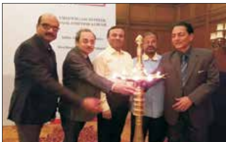
STRIDE, organized by WBAP