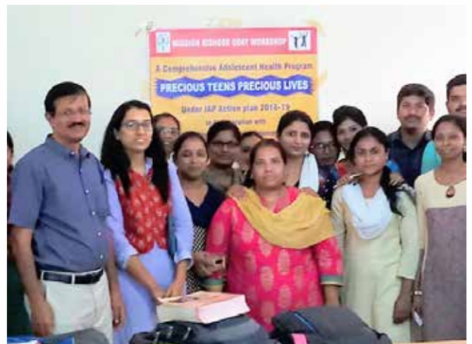
MKU program at Government Nursing college, KIMS Hubballi on 22 February 2019