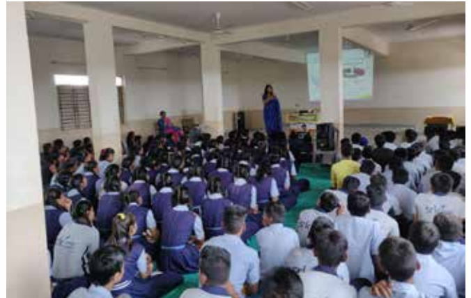
200 girls and 100 boys of Nagar Prathmik School benefitted. Audience - Std. 6,7 and 8th. Principal and 8 teachers were also attended.