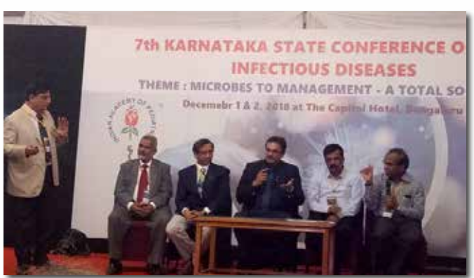
7th Karnataka State Conference of IAP- Infectious diseases - December 1st & 2nd 2018