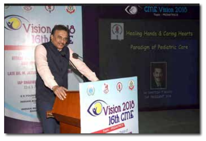
Vision 2018 16th CME-23rd December 2018 - Dharwad