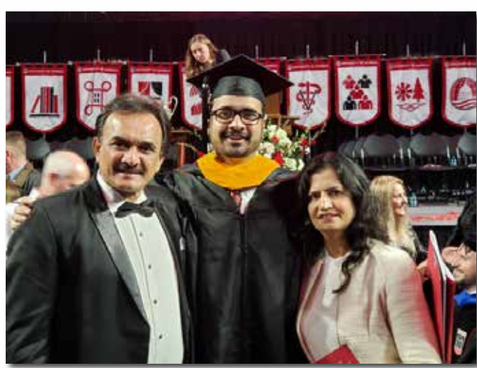
Atlanta - 12th to 18th December 2018