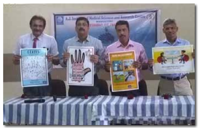
National hand washing awareness week celebration