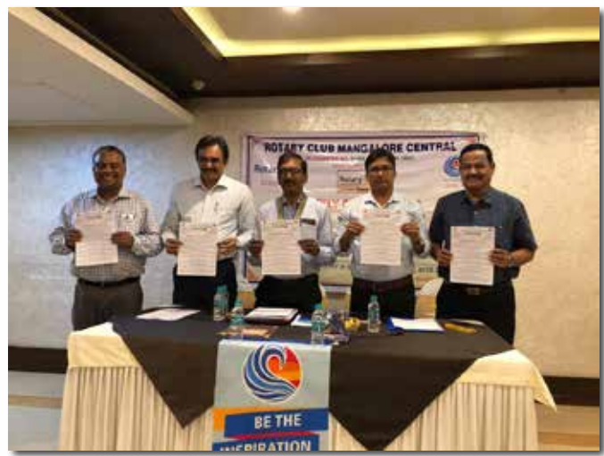
Rotary Club, Mangalore Central - 21st December 2018