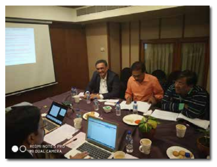
CRC meeting at Mumbai - 29th December 2018