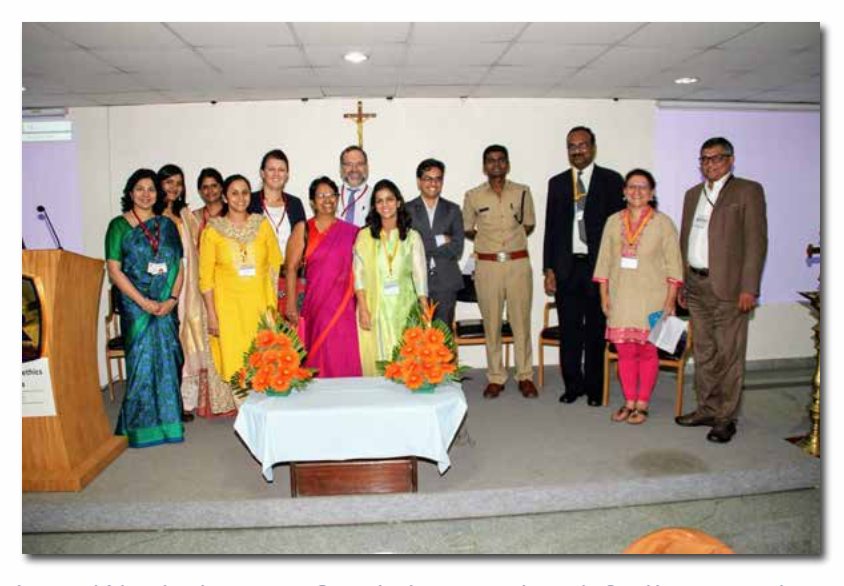
Pediatric Bioethics Workshop at St. John Medical College -7th December 2018