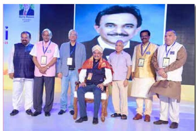
Feliciattion on 28th December 2018 at Mangalore