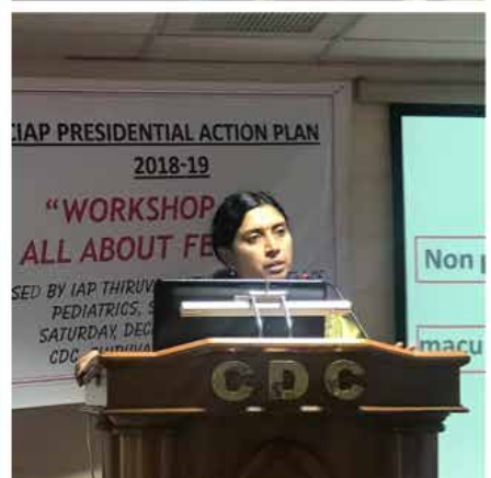
All about Fever workshop conducted at CDC Thiruvananthapuram on 22.12.18 by IAP Thiruvananthapuram in association with Dept of Pediatrics, SAT.