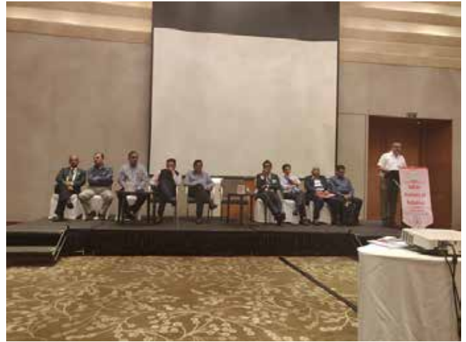
Congenital HT ToT and SGM at Mumbai