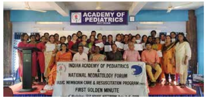
BNRP programme- IAP Kottayam