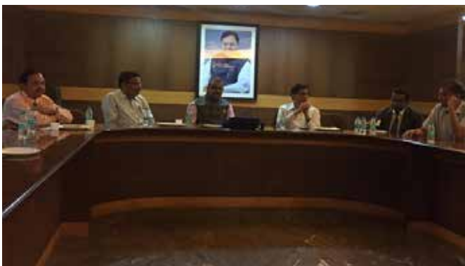
Expert group meeting for AES cases in Bihar