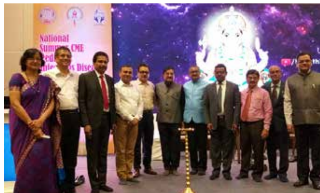
Summer CME, Kolkata