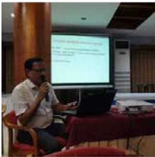
Immunization CME - IAP Palakkad