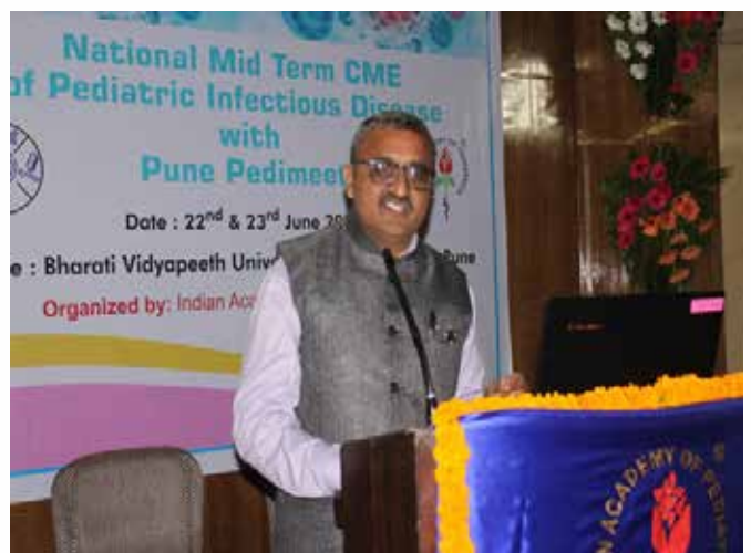
National CME, Pune