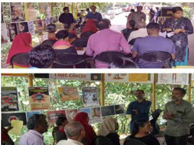
World No Tobacco day - IAP Thalassery