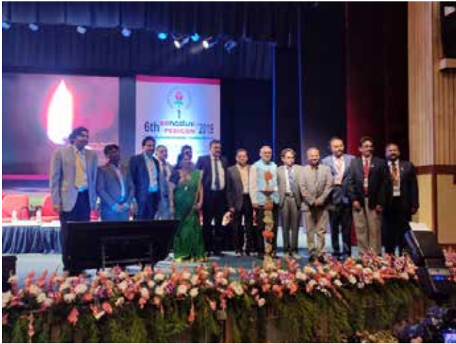
Bangalore Paediatric Society Annual conference