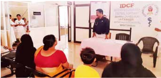
IDCF programme - IAP Kannur