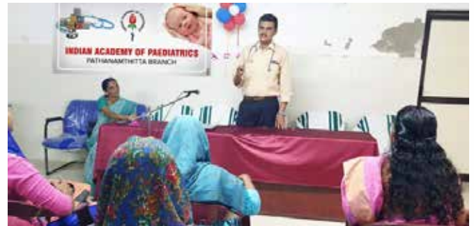
BLS programme - IAP Pathanamthitta