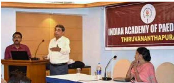
Class on parenting - IAP Trivandrum