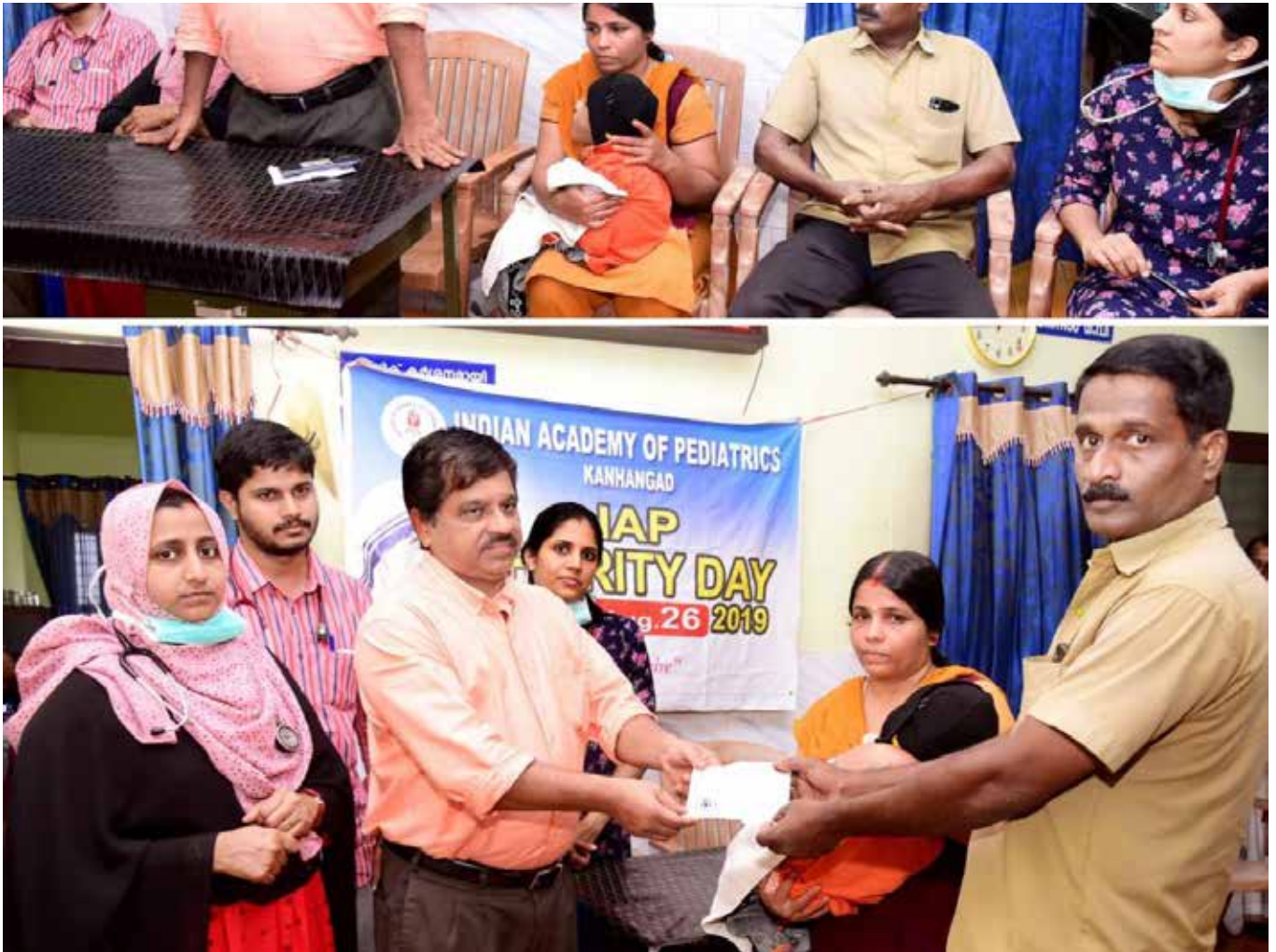
RATIONAL ANTIBIOTICS DAY