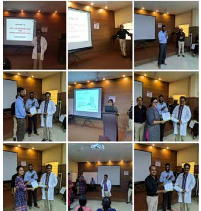
Divisional Quiz for undergraduates 2019