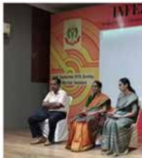
Infezione 2019 (Infectious Disease Update)