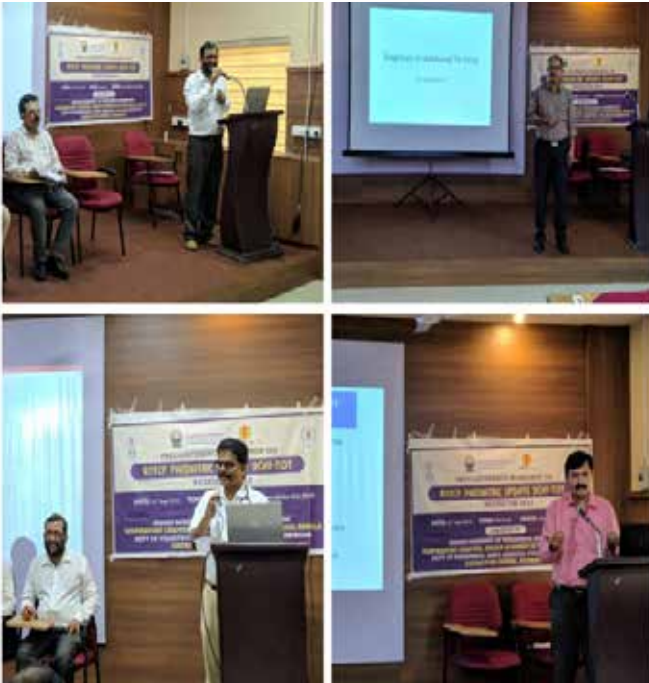
RNTCP Pediatric Update 2019- TOT - Respicon Kozhikode 2019