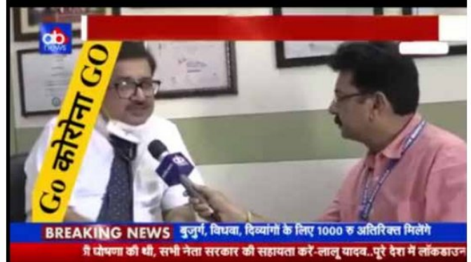
This interview was recorded extempore without any prepared questions!!!