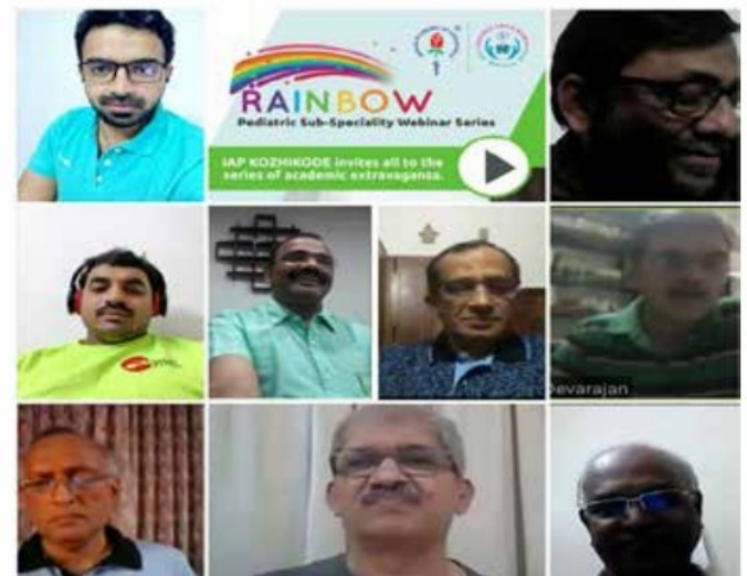
RAINBOW series IAP Kozhikode