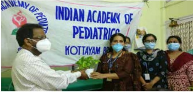
World Environment Day - IAP Kottayam