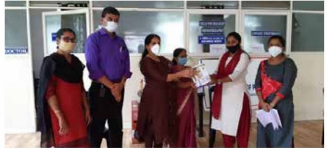
IAP Kottayam Chariot activities - PPE Kit distribution to media persons