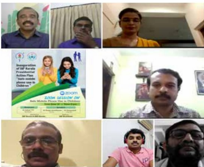
Safe mobile use in children - organised by AHA Kerala & IAP Kozhikode