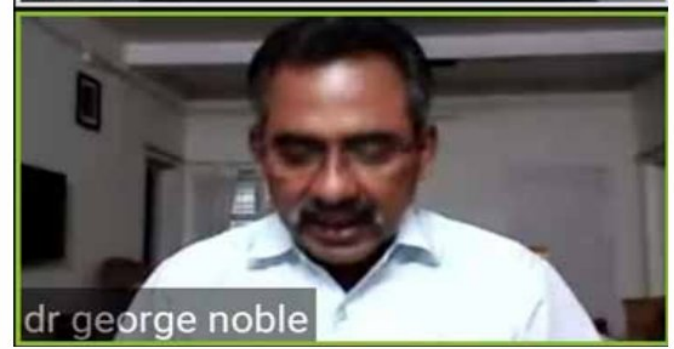
IAP Malanad webinar