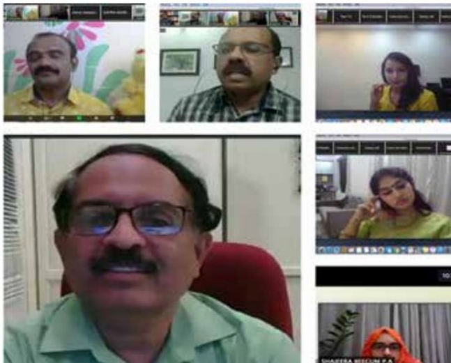
IAP Kerala presidential Action Plan - Dermatology for pediatricians - IAP Thalassery & IAP Kerala Dermatology Chapter