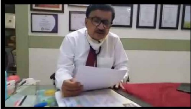
Public awareness program on Covid-19 is recorded in public interest