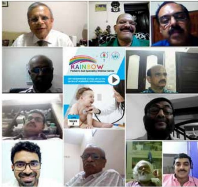
RAINBOW series IAP Kozhikode