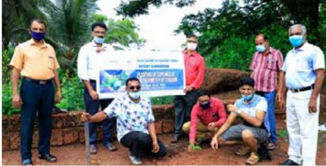
World Environment Day - IAP Kanjangad